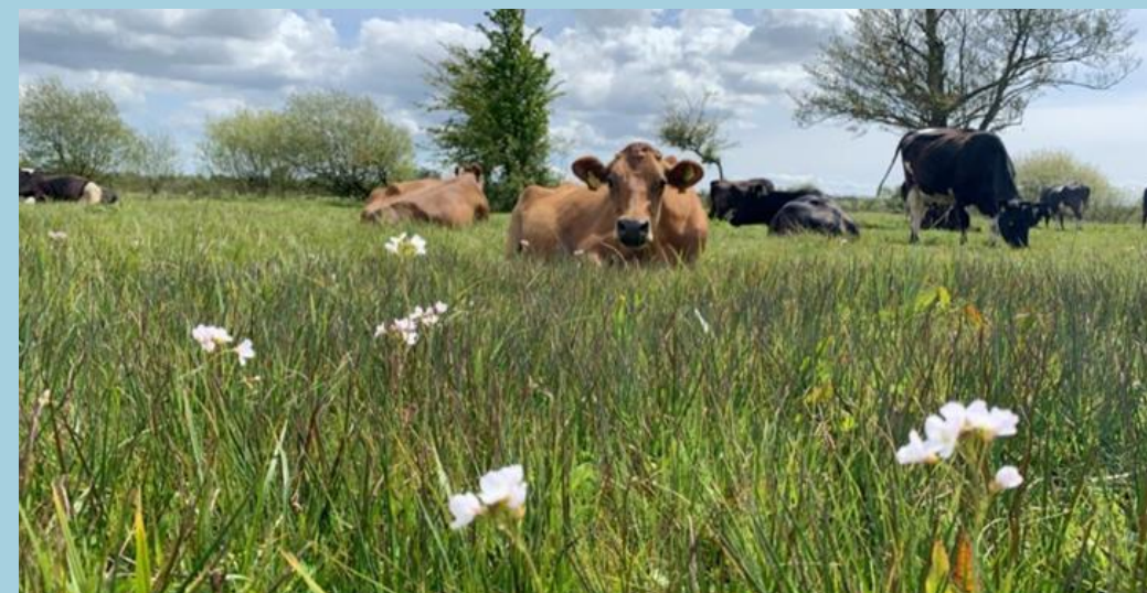
Image of Dairy cows grazing

Primary research directly from Organic Beef & Dairy farmers allowed for a better understanding of Organic farming in Ireland, as it is information from real world practical experiences, farmers that know what works & what doesn't work when it comes to managing an organic farm successfully while complying with organic rules & regulations.