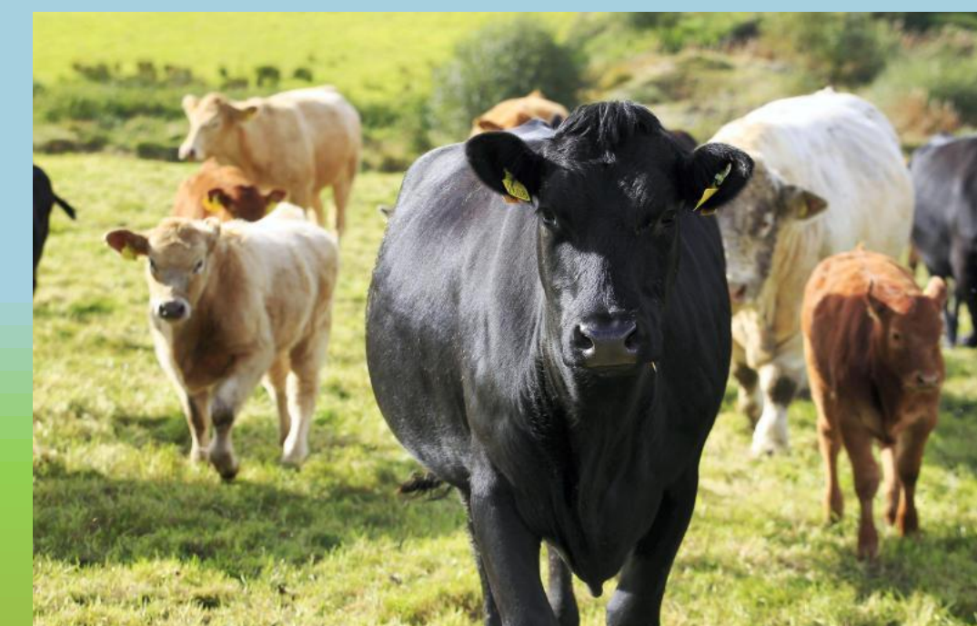
Image of Suckler beef cattle