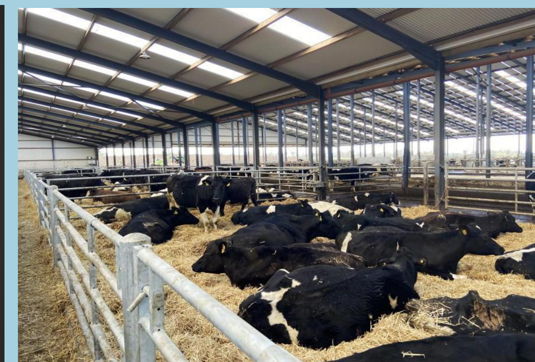
Image of Cattle on straw bedding

Using secondary & primary information collected throughout the project, its shown that organic beef & dairy farming can be a viable/ successful process once certain criteria/ guidelines are used, such as –