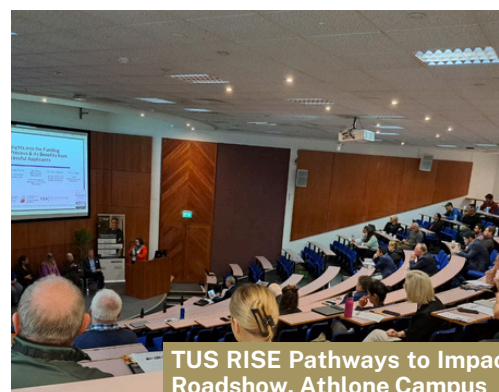
TUS RISE Pathways to Impact Roadshow. Athlone Campus