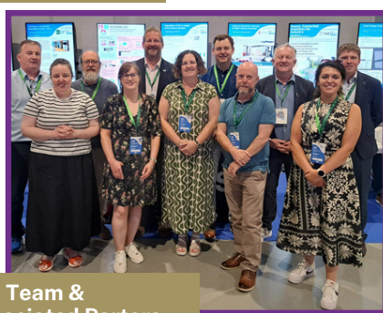
RDI Team & Associated Partners

TUS Research Showcased During RUN-EU Innovations Meets Regions in Portugal. APT, COMAND, IDEAM Cluster, The Irish Bioeconomy Foundation, Limerick City & County Council and our research support team showcased the very best of TUS research and facilities in Braga. || READ MORE