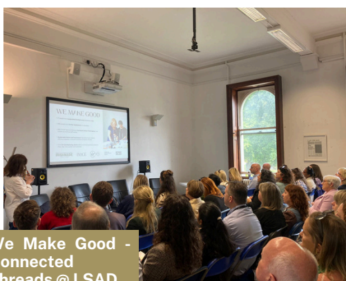
We Make Good - Connected Threads @ LSAD