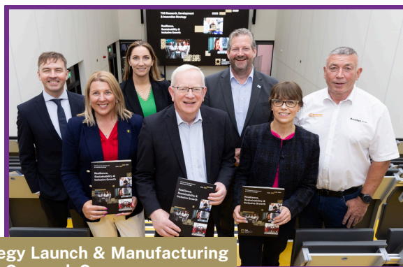
RDI Strategy Launch & Manufacturing Solutions. Coonagh Campus