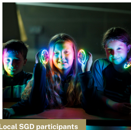
Local SGD participants in TUS Thurles